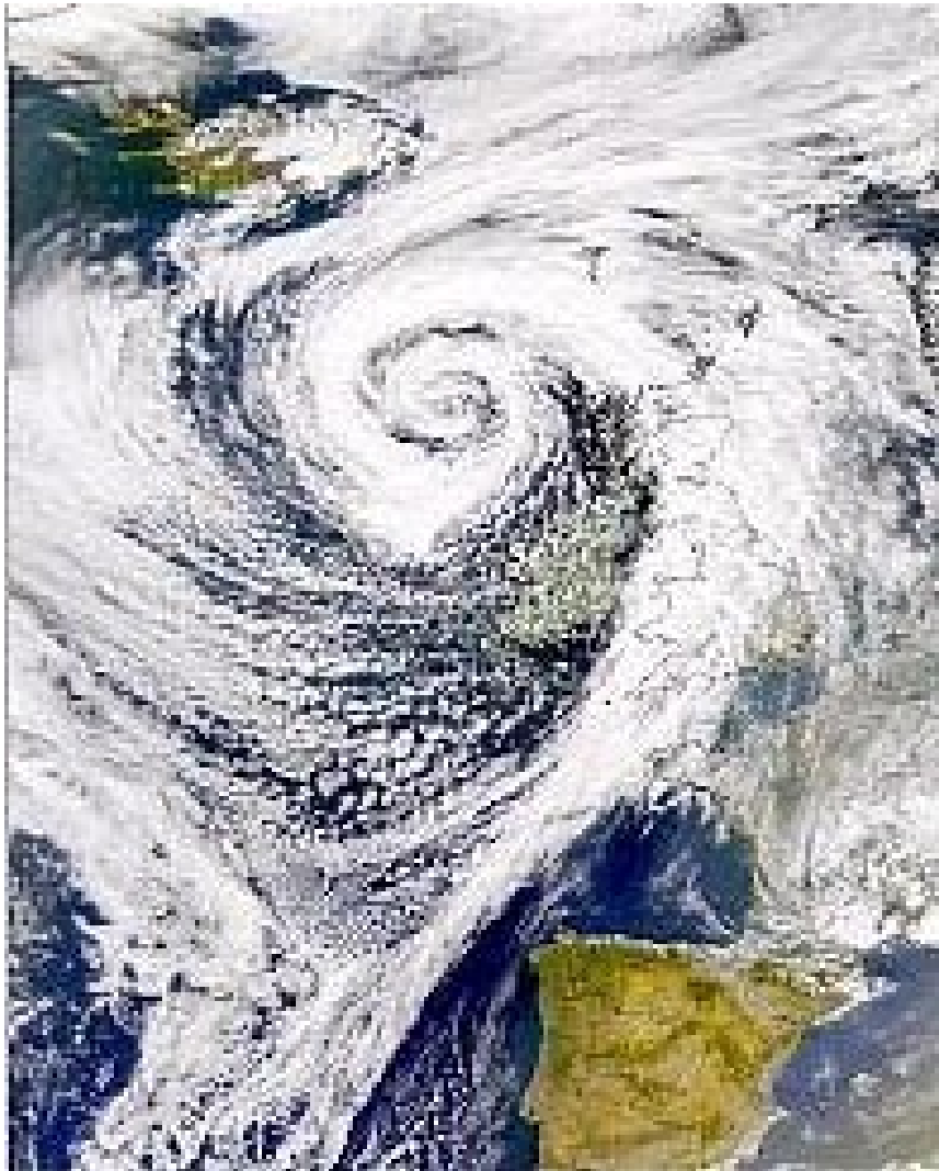
Weather system over the Bay of Biscay